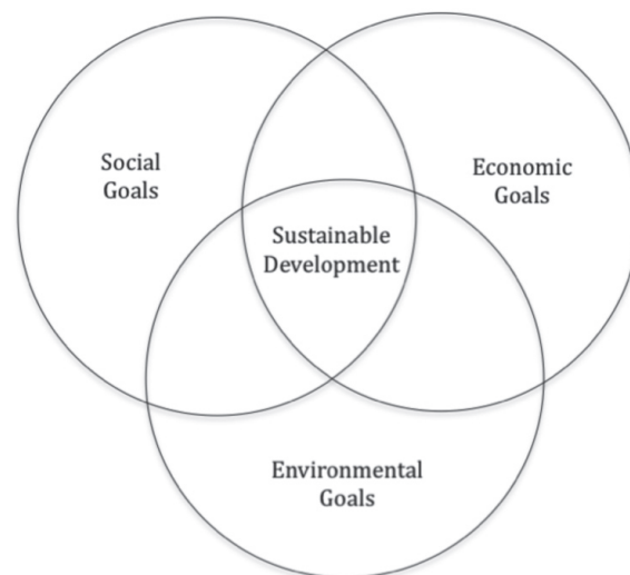
Figure 1. Common conceptualizations of sustainable development.

This shift towards oikos is intended to gently disrupt narratives of the last two decades that have sought to reframe our work in terms of education for sustainable development, often with a focus on the economy, society, and environment. These three concepts have frequently been explained and presented as equal and overlapping circles in a Venn diagram, with sustainable development at its intersecting centre (also referred to as the three-legged stool model).