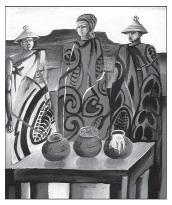
Figure 1: Illustration of nkhoana-tharo , artwork courtesy of Peter Sek

Their intellectual traditions and thought-systems rest on the assumptions of cosmic interrelationship. These conceptions form a basis of communal relationship as well as sympathetic relationship with the natural environment... A cosmic self cannot objectify the universe. The more "intelligent" such self becomes, the more it understands language as metaphor. This idea is common to the thought-systems... The highest, most profound truths cannot be verbalized and one reaches for the dimension beyond the profane world where the meaning of the symbols becomes clear. (p. 45)