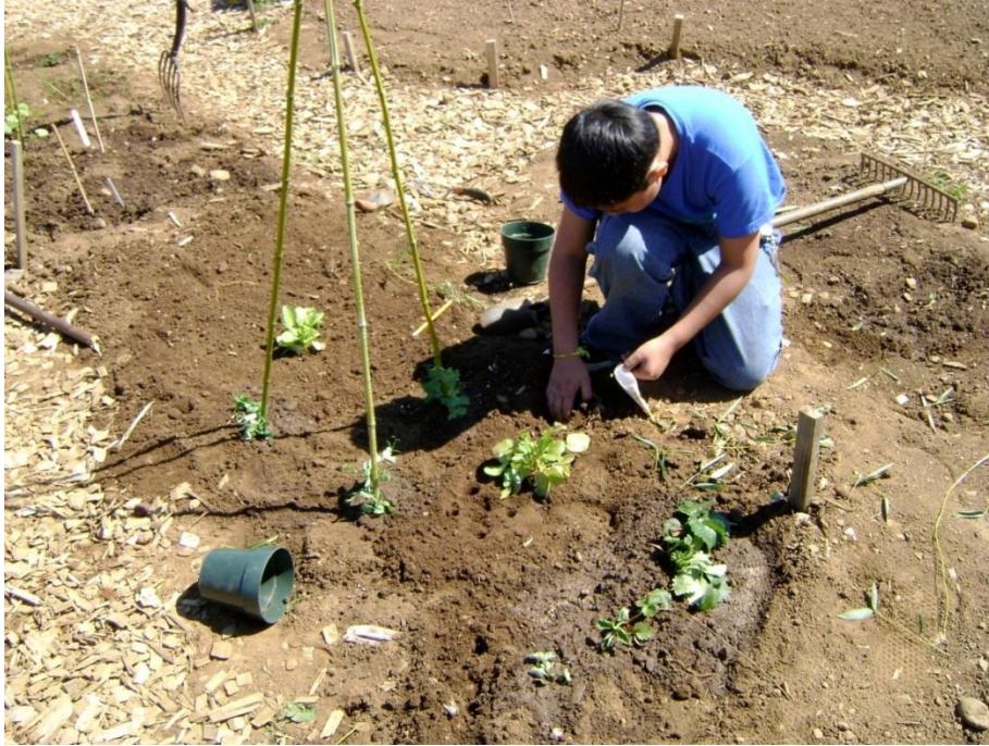
Figure 4: Student focused on planting