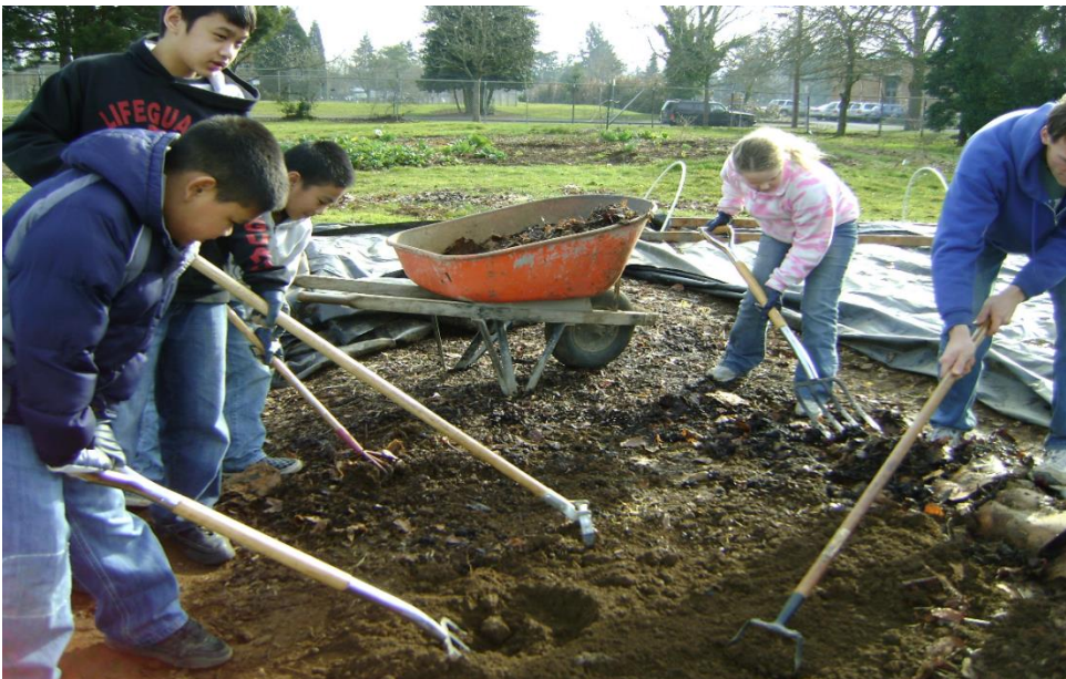
Figure 3: Preparing garden beds