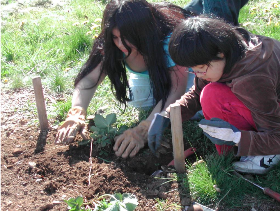
Figure 2: Transplanting