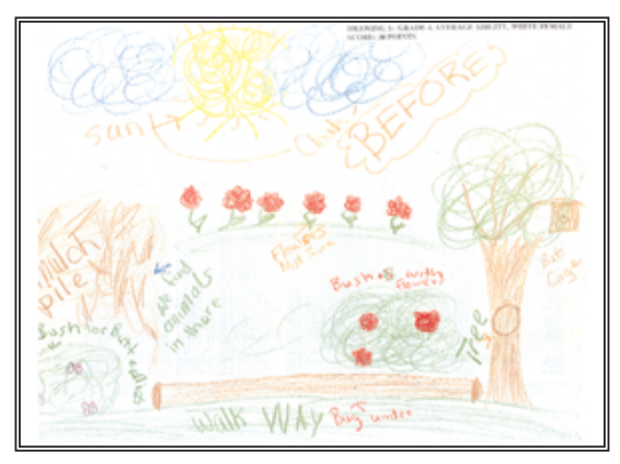
Figure 1. Grade 4, Average Ability, White Female. Score: 30 Points

Figure 1 was completed by a fourth grade, average ability, White, female student. Her drawing's average total score for the three raters was 30 out of 35 points. Virtually the entire drawing is covered with features; she included at least 10 different features in her drawing; she drew a few features, such as flowers and bushes, more than once; she clearly emphasized the natural features of her schoolyard habitat; she focused on the broader system rather than one small component; she used many descriptive words and phrases; and except for the fact that she drew only one tree, her drawing very closely matches her actual school site's features. Interestingly, this student's schoolyard habitat was destroyed about three months before this drawing was completed due to the installation of portable classroom buildings, explaining the large label "BEFORE" in the top right section of her drawing. This drawing reflects a very accurate memory of a site she had not seen for several months.